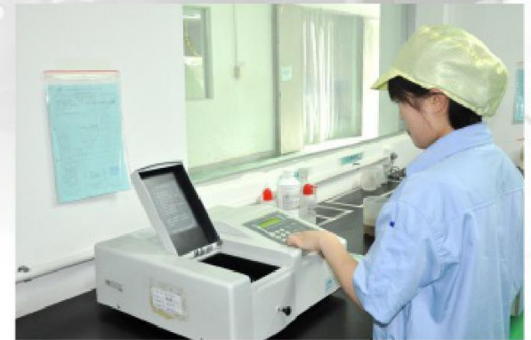
紫外可见分光光度计 UV Vis Spectrophotometer