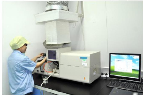
原子吸收光光度计 Atom Absorb Spectrophotometer