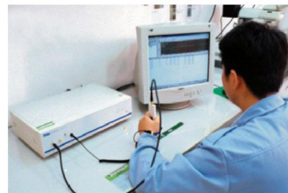
阻抗测试仪 Impedance Testing Machine