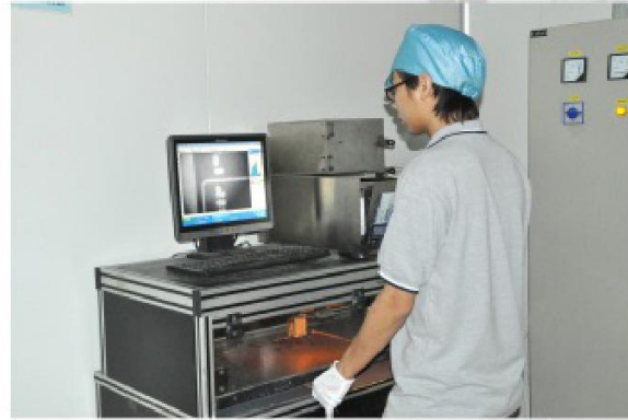
X-RAY 检查机 X-RAY Inspection Machine