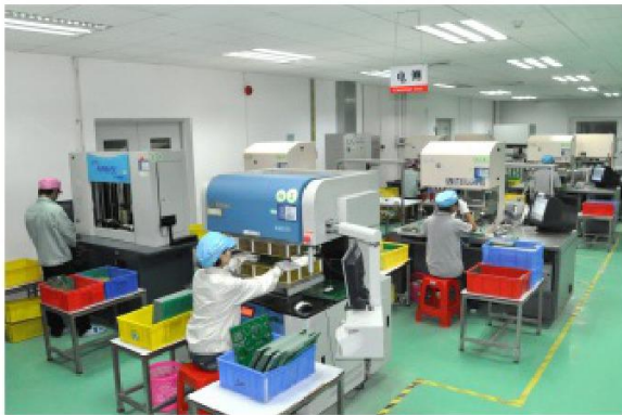
飞针机&通用机 Flying Probe &Electrical Test Machine

Our company has the full set of testing equipment, to ensure the product quality meet all international standards and customer satisfaction.