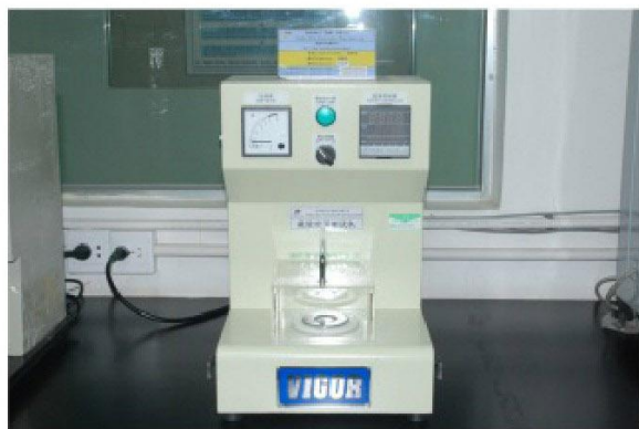
纤维胶化时间测试仪 Prepreg Gel Time Test Machine