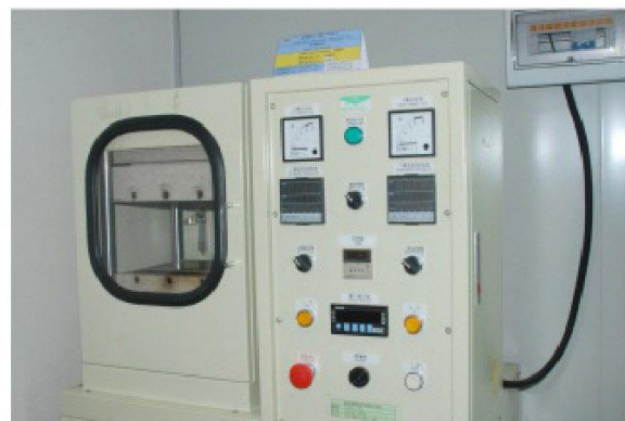
IQC压板机 IQC Lamination Machine